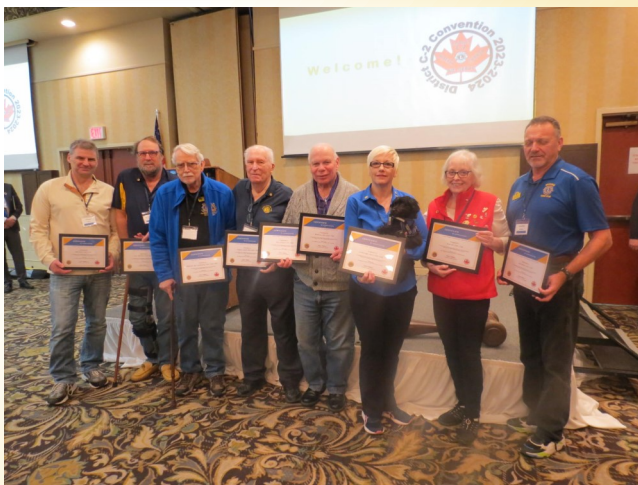
Representatives from the sponsoring clubs receiving District Governor's Certificates of Achievement.